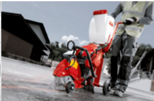
The DSH 900-40 in action on the DSH-FSC floor saw cart.

Experience freedom and exceptionally fast cutting power with the new Hilti DSH hand-held petrol saws. Cutting performance at up to 150mm depth, combined with the reliability and reduced operating costs you expect from Hilti make these machines perfect companions on every job site.