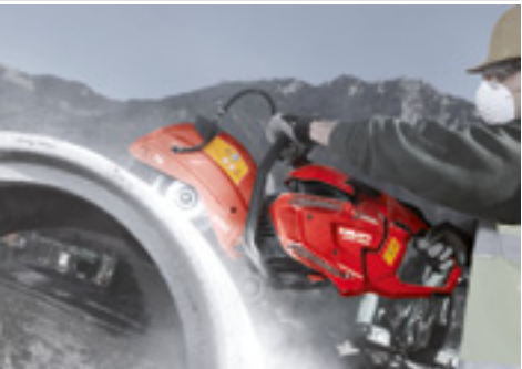
The DSH 900-40 makes light work of cutting concrete pipes with a thickness of up to 150 mm.

Long service intervals, low fuel consumption, consumable kit included with every tool purchase. Considerably cuts operating costs.