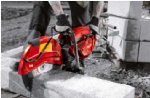
Fast and accurate cutting of concrete or masonry blocks on the job site using the Hilti DSH.